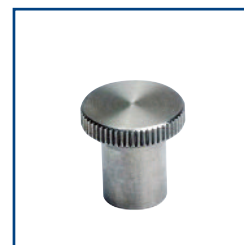
Platen 19 mm (432-125)