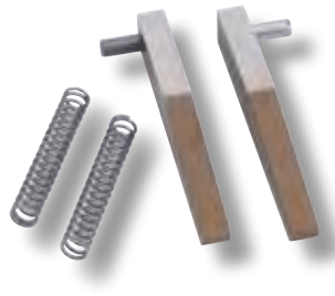
Shown: ML4242 Jaw Replacement Kit