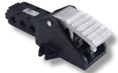
Shown: ML1797 Foot Pedal Controller. Supplied standard with ML3353.