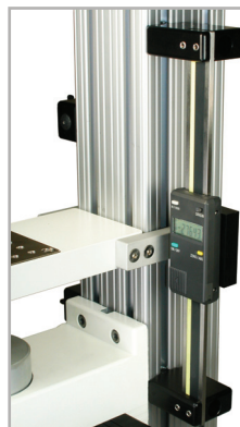
^ Optional digital travel display