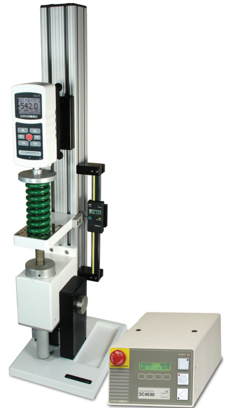
The TSFM500-DC is shown in a typical spring testing application, with Model M5-1000 digital force gauge and compression plate.