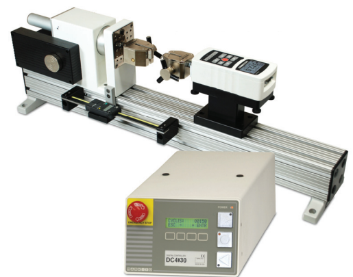
The TSFM500H-DC is shown configured for a tensile test, with Model M5-1000 digital force gauge and wedge grips.