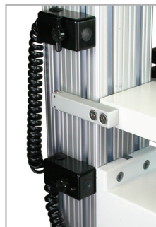
^ Included set of adjustable limit switches