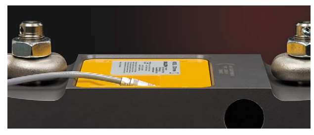
Small details improve durability. The EDXtreme features a recessed connector and embedded antenna to help prevent damage from snags that commonly disable other instruments.