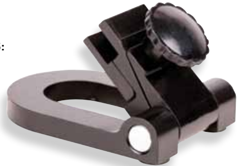
Micrometer Stand, No. 52-247-005