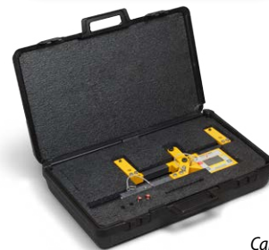
Carry case included

Dillon also manufactures highly accurate electronic and mechanical dynamometers and crane scales.