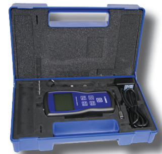
FG-7000 with Accessories in Protective Carrying Case