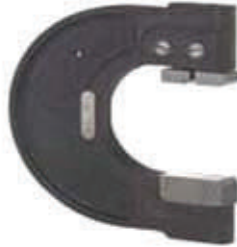
MODEL "C" STYLE 108