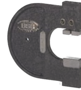
MODEL "MC" STYLE 102 (MIDGET STYLE C)