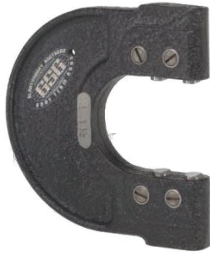
MODEL "A" STYLE 104