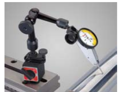
660 shown with 708BZ Dial Indicator