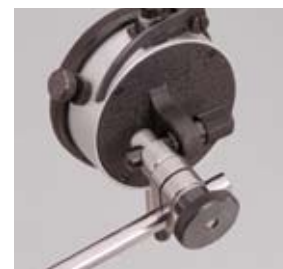
Left: 657AA with 711FS Last Word® Dial Test Indicator Above: 657AA with 196B1 Universal Dial Indicator Above Right: 657Y with lug-on-center back