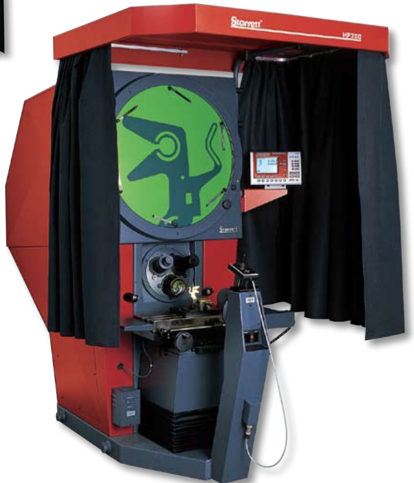
Above: HF600 Right: HF750

Side bed models, HS600 and HS750, are also available.