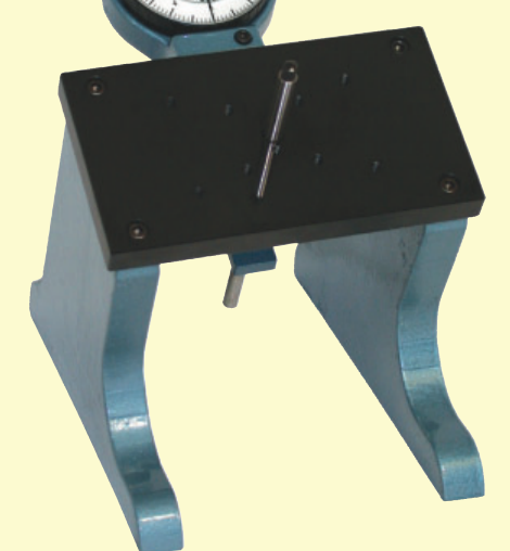
BG-2 Bench Gage

The BG-2 utilizes a right angle movement that offers substantial benefits. The indicator, in a protective housing, is mounted above the rest plate in a position that minimizes operator eye movement. The gaging mechanism is reversible, retractable, has a 3" range of measurement travel and .075" of gaging travel.