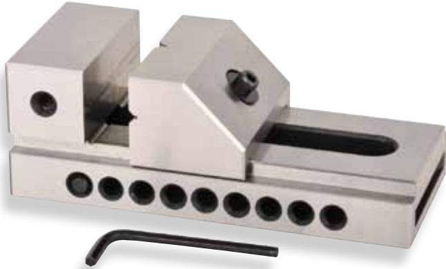
▲ Toolmaker Vise No. 52-466-222.