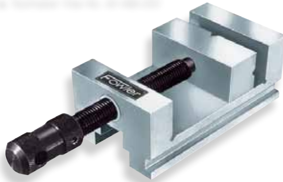
▲ Toolmaker Vise No. 52-466-000.

Fowler's high accuracy Toolmaker Vises make precision holding possible for inspection, precision jig boring, milling and grinding.