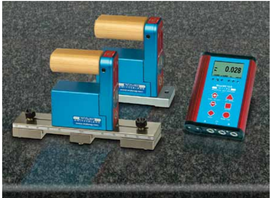
Shown: 54-895-250 - Surface Plate Kit with BlueMeter Basic

The Fowler/WYLER Surface Plate Kit is a full-featured and economical kit designed specifically for testing surface plate flatness quickly and accurately.