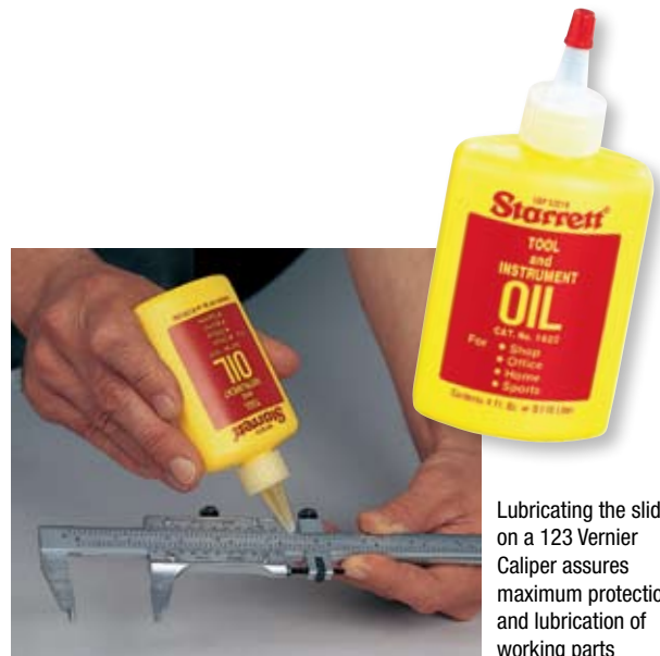
Lubricating the slide on a 123 Vernier Caliper assures maximum protection and lubrication of working parts