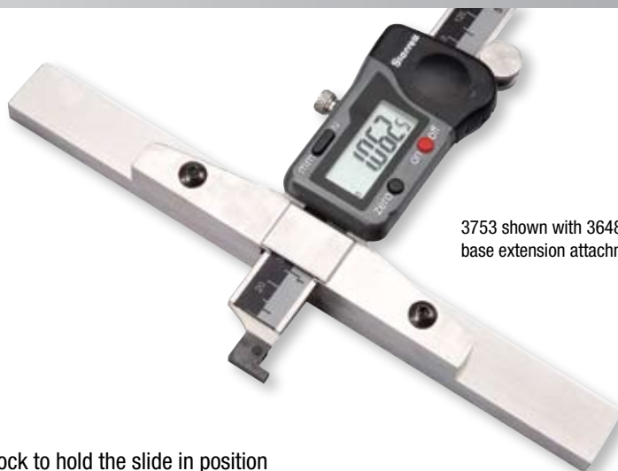
3753 shown with 3648-180 base extension attachment