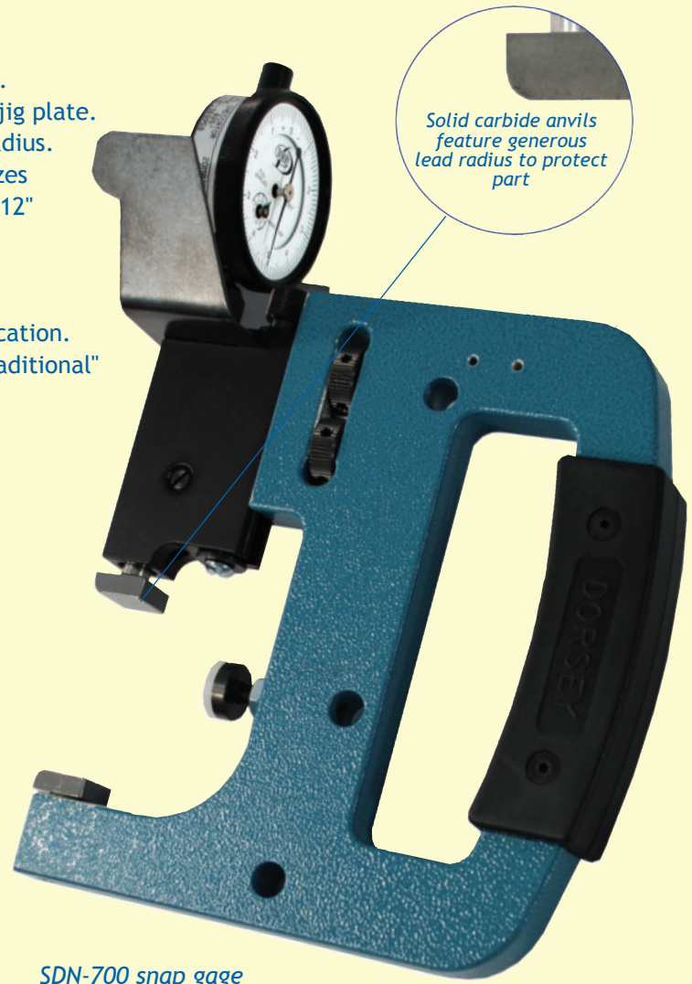
SDN-700 snap gage