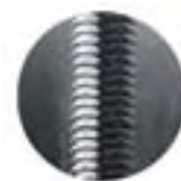
V-Notch Cut Faces