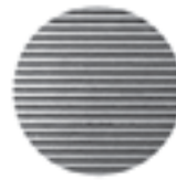
Straight Cut Faces