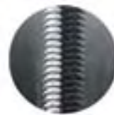
V-Notch Cut Faces