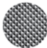
Cross Cut Faces

Thread Upper Grip - 5/8" Eye End Bottom Grip - 5/8" Eye End