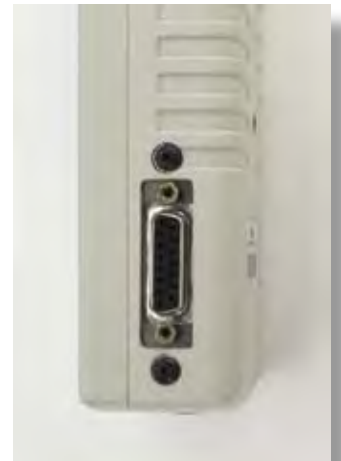
Shown: Sensor connection port on the Chatillon DFS-R-ND Series gauge.