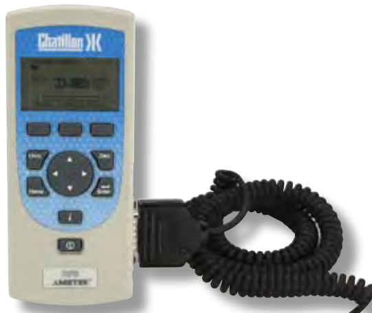
Shown: SLC Sensor attached to the Chatillon DFS-R-ND gauge.