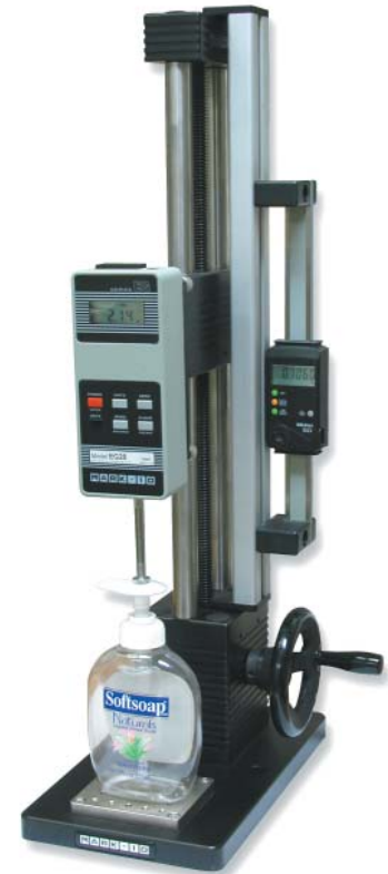
The ES30 is shown in a typical compression testing application, with Series EG digital force gauge, digital travel display, and attachments