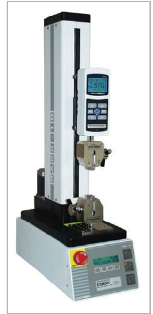
Shown with an ESM301 test stand and G1061 wedge grips

On-board data memory for up to 50 readings is included, as are statistical calculations with output to a PC. Integrated set points with indicators and outputs are ideal for pass-fail testing and for triggering external devices such as an alarm, relay, or test stand. The gauges are overload protected to 150% of capacity, and an analog load bar is shown on the display for graphical representation of applied force.