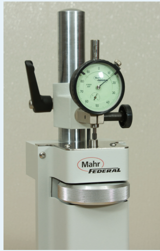
Long range dial indicator