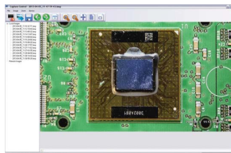
Image capture software

Instantly capture an HD image. The captured images can be used for further processing, or stored in a variety of formats including BMP, JPEG & TIFF.