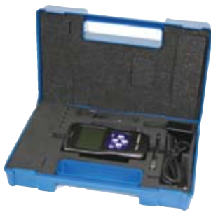
FG-3000 with Accessories in Protective Carrying Case