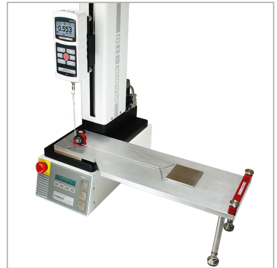
Shown with an ESM301 test stand and G1086 COF fixture

The M5-2-COF may also be used for a number of common tension and compression testing applications. The gauge is based on Mark-10's Series 5 advanced digital force gauges, and includes the series' full set of functions and settings.