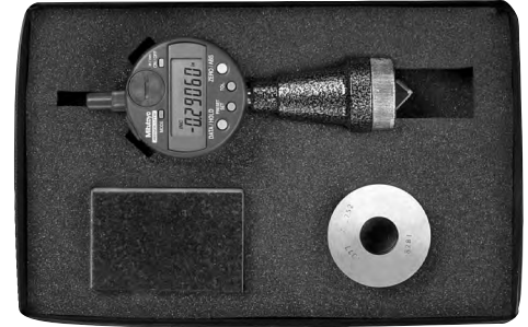
547-480 Shown with optional setting master.