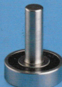
1" x 5/16" (25 x 8)