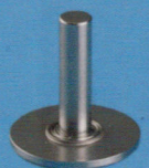
Zero Style Roller