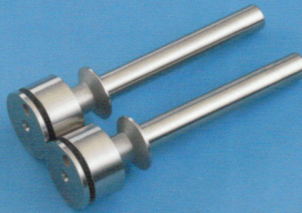
Half Zero Rollers 110HZ