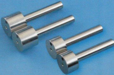
Model H & HL Rollers