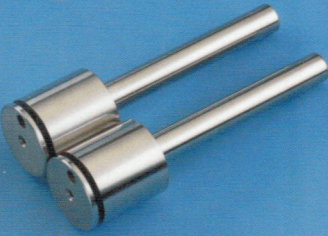
Full Zero Rollers 110FZ