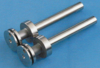
Quarter Zero Rollers 110QZ