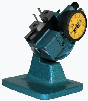
Gage shown is DYS with special metric indicator, part# 2305 arms, and part # 18967 bench stand