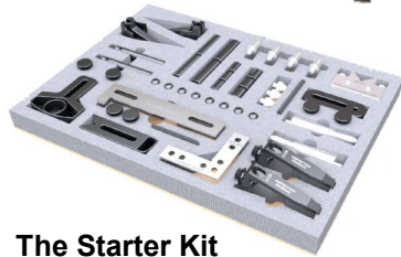
The Starter Kit

Loc-N-Load™ aluminum fixture plates interlock magnetically to remain firmly secured, yet release quickly and easily for the next job. The system installs effortlessly on all CMMs.