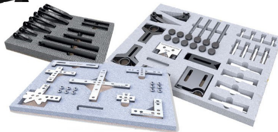
The Complete Kit