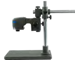
Single arm stand