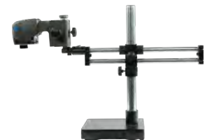
Double arm stand