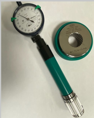
Max. diameter 50 mm

Measurement Over Balls (MOB) gage options for INTERNAL splines