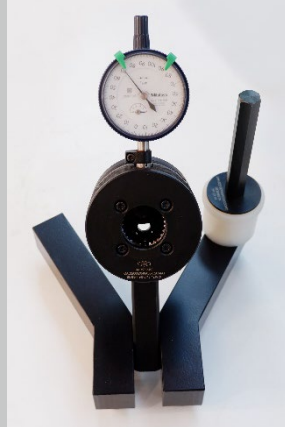
Max. diameter 50