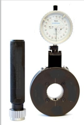
Max. diameter 50 mm

Measurement Over Balls (MOB) gage options for EXTERNAL splines