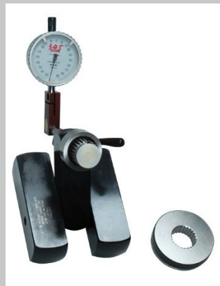
Max. diameter 50 mm