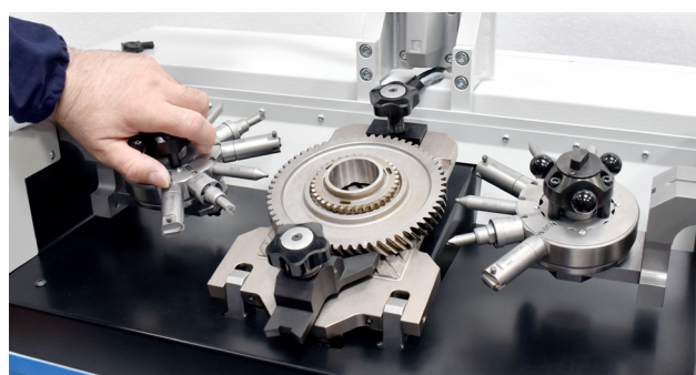
Ease of use and retool

The use of an appropriate software allows the measuring groups to approach the surface of the teeth with a controlled low force while monitoring their position error. This is identified as the proper solution to avoid damages and marks on parts.