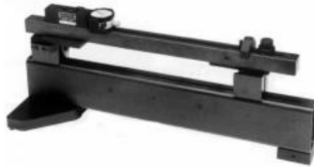
No. 560 Gage with 590 Reference Master

Reference masters are set by the gage after it has been set to the required dimension by gage blocks, etc. The reference master can then be placed in the production area to periodically verify the gage setting.