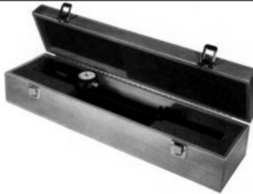
Model 560 with No. 560-1 Hardwood Storage Case